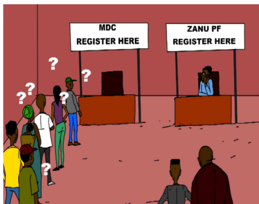
Figure 1. Voter registration.

In one of the scenes Nyoka and Kunyepa witness an election registration center where prospective voters are queuing to register for the 2013 presidential elections. Surprisingly there are two queues one for the MDC and the other for ZANU PF supporters. As seen in figure 1, the queue with MDC voters is oversubscribed. However the ZANU PF registration center is deserted. Whilst it cannot be disputed that the MDC has dominated the urban vote since its formation, it would be an exaggeration to completely dismiss ZANU PF as a serious threat as the party has gained traction winning some seats in the past elections. It should be noted as well that ZANU PF and the MDC despite dominating the electoral space, are not the only players. As such there seems to be a deliberate exclusion of other political parties from the animation's public sphere. This uneven distribution of power works only to serve polarization and propaganda. At this point of the animation, the cartoonist's creative agency comes to the fore where they have re-contextualized the prevailing media polarization, reversing the framing of the ruling party's hegemony.