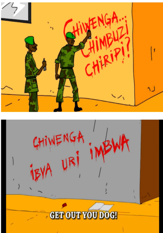
Figure 3. Junior soldiers denouncing General Chiwenga.

The military-led ZANU PF government that came into power in 2017 after a military coup, frames social media as an "asymmetric threat" and as intent on "command and control" [11], Because of fear, in Zimbabwe, it is unheard of for subordinates to challenge their superiors in public. Even if such a forum is available, free speech cannot be realized owing to constraining issues of hierarchy and protocol. The animation becomes a dialogical forum outside the knowledge of the authorities empowering even those who are afraid to speak, to speak without fear [9].