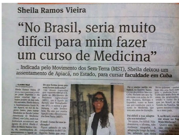
Figure 2. Local Newspaper.

The image above is a photograph of a newspaper report, in which the title of the story and the speech of the person interviewed contain exactly the use of the pronominal variation prepositioned by the preposition “to” with a verb in the infinitive: “In Brazil, it would be very difficult for me to take a medical course”.